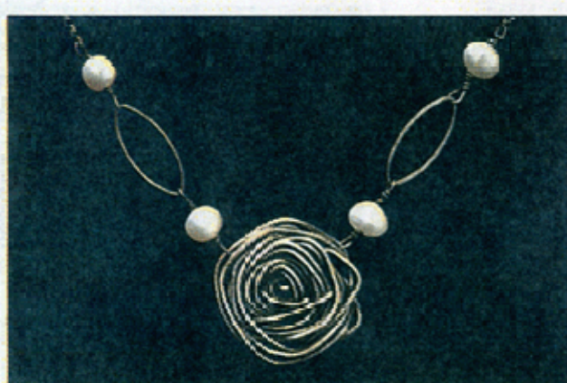
A necklace from Michele Grady's "rose collection" (above) is made of sterling silver wire and freshwater pearls. A copper heart (right) is bound with sterling silver wire.